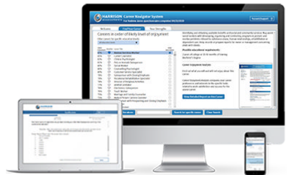
Online Interactive Career Portal